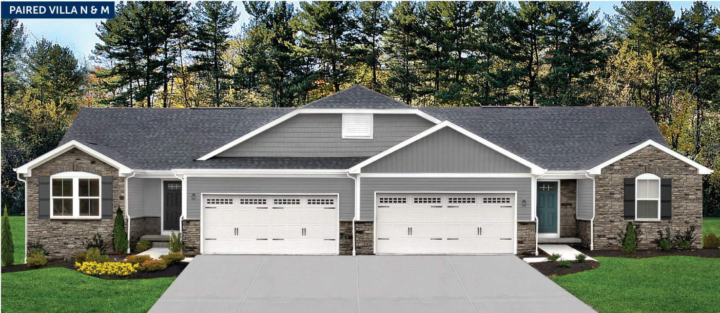
PAIRED VILLA N & M